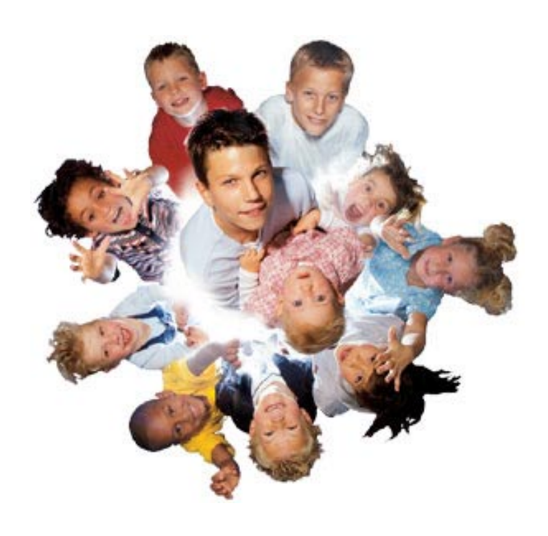
®LEGO is a brand name and the property of the LEGO Group ©2004 The LEGO Group